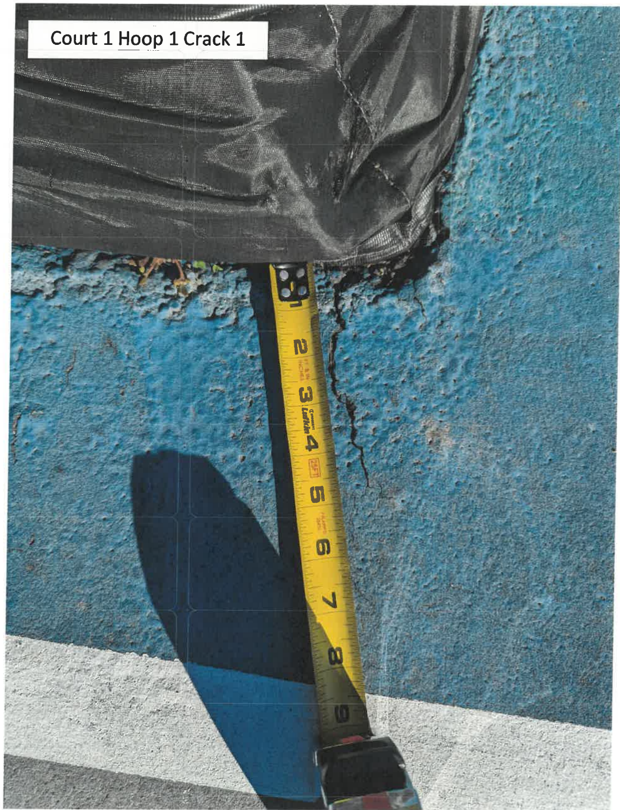
Court 1 Hoop 1 Crack 1