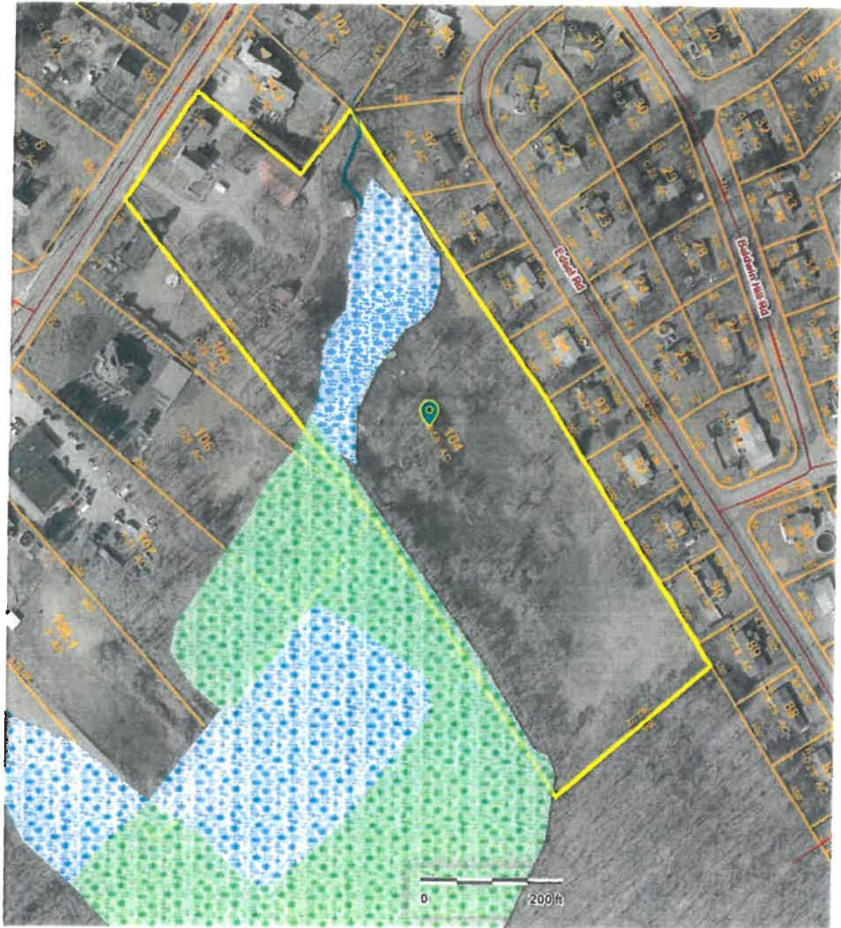
Photo 1. AxisGIS Aerial Imagery Showing 359 King Street and Approximate Wetland Locations.