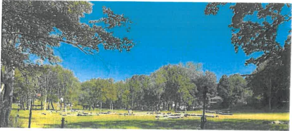
Photo 5. Trees Felled