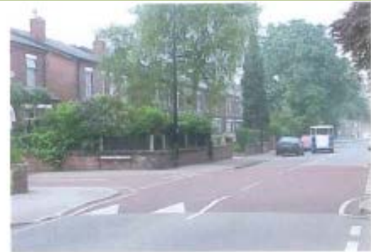
Elevated speed tables