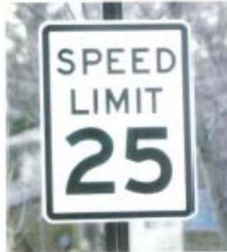
Reduced speed limits