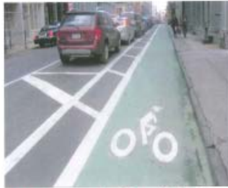
Bike lanes or buffered bike lanes