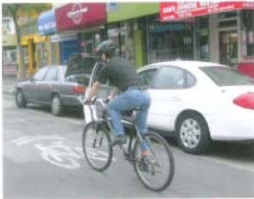
Markings for shared lanes