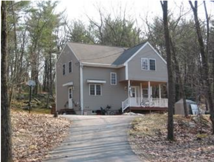
The Belliveau Family Harvard Road, Littleton