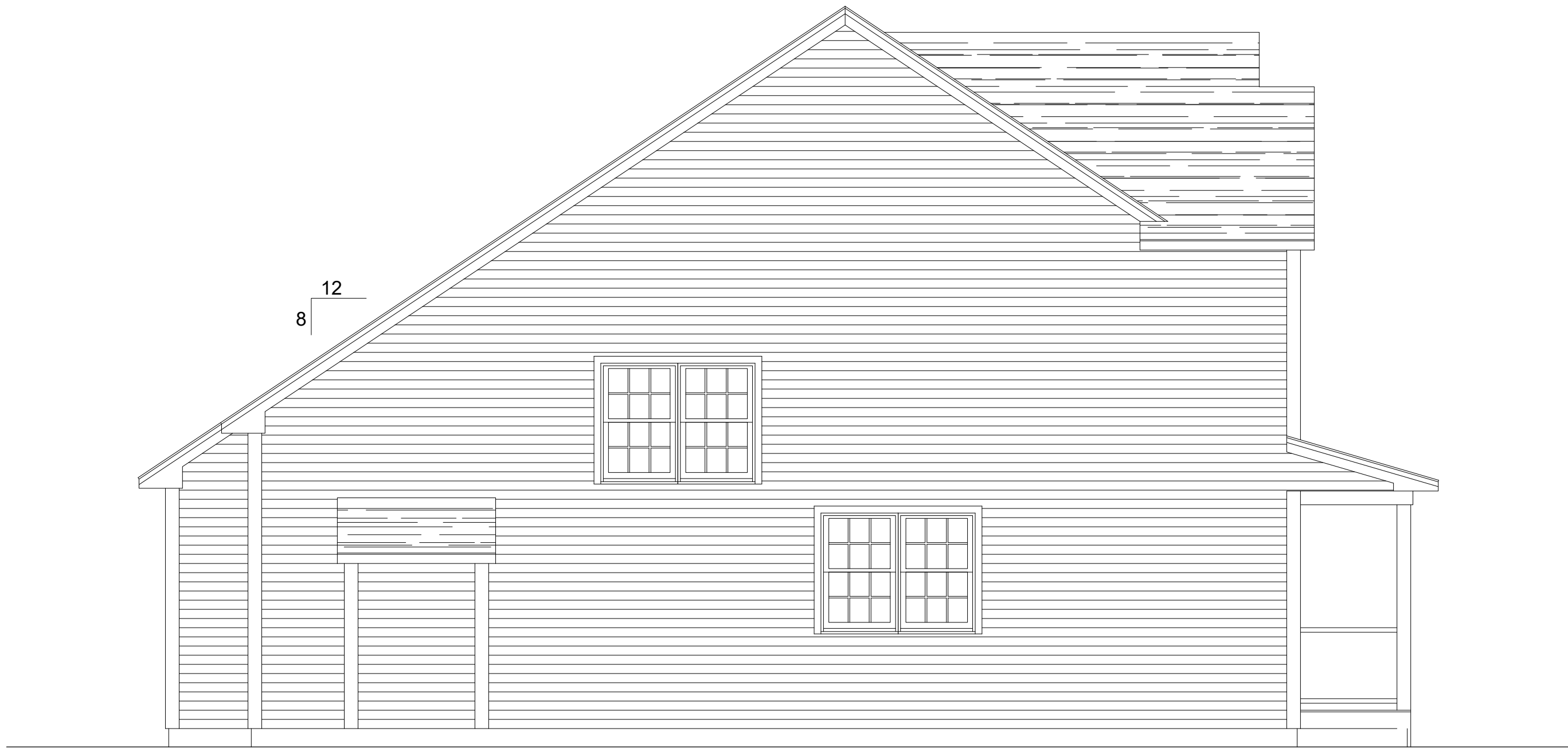
LEFT ELEVATION SCALE: 1/4" = 1'-0"