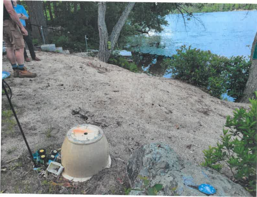
June 27, 2023 photos showing area of sand dumping