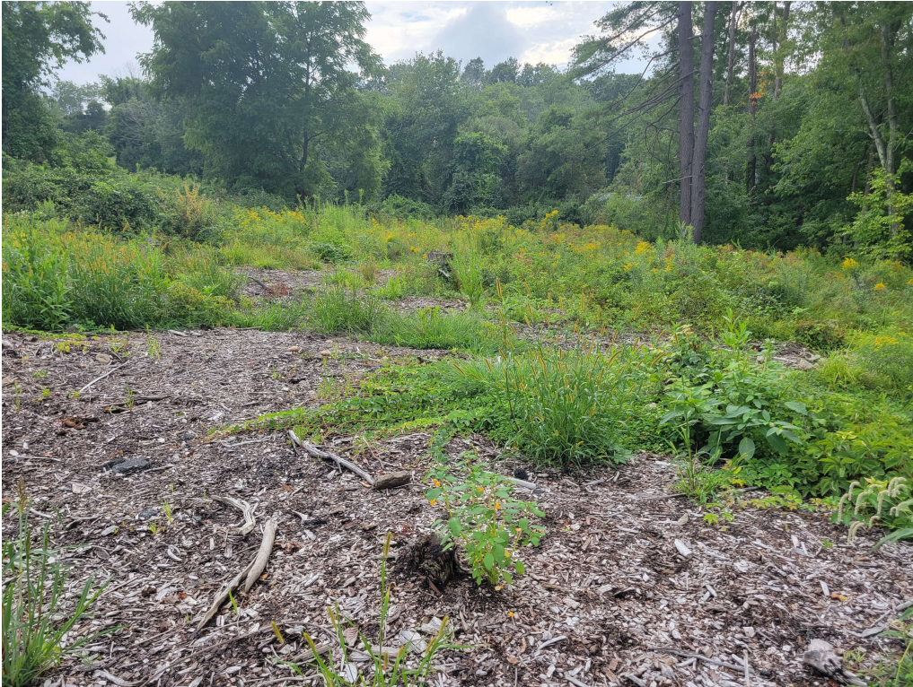
Figure 2. Revegetation area of property; not cattail at for end (see Figure 3)