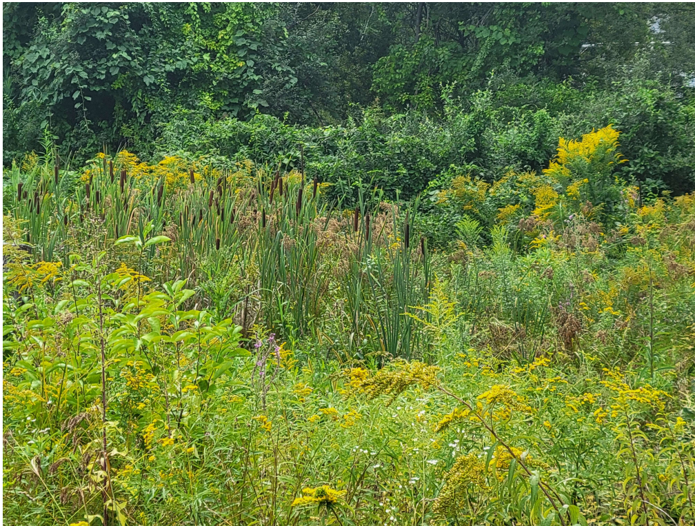
Snapshot of October 3, 2023 Restoration Plan